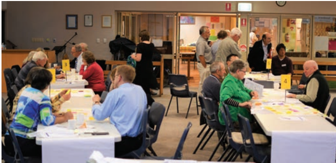
Discussions underway during the first consultation workshop at SMIV